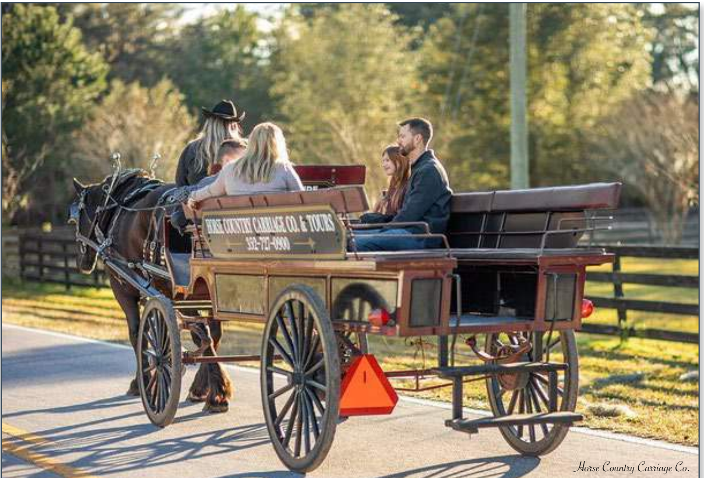
Horse Country Carriage Co.

Libby and Luther are new. Their personalities and eagerness to travel make them a fun team to ride along with, as it is not unusual for them to whinny to their friends in the pastures along the way. Tiny Prince Charming is 18.3 hands tall, and performs carriage rides at Brownwood in The Villages. Chip and Dale, are palomino ponies that like children's parties. Their pint size hitch wagon is reminiscent of the Budweiser beer wagon.