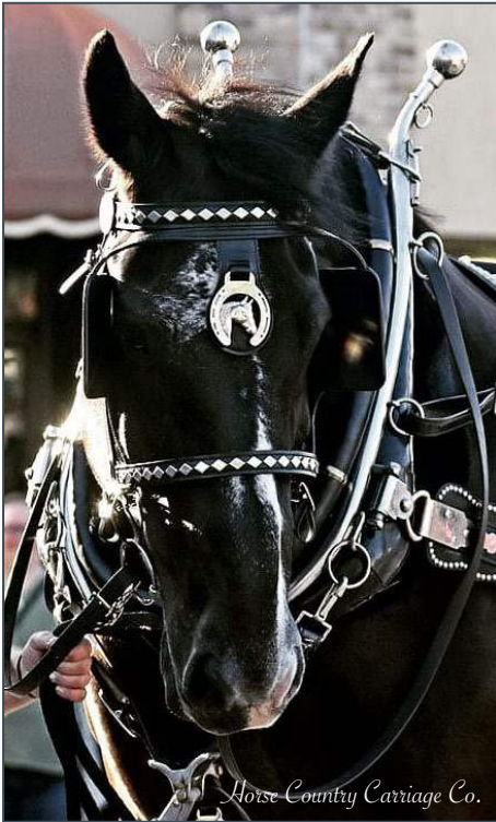
Horse Country Carriage Co.