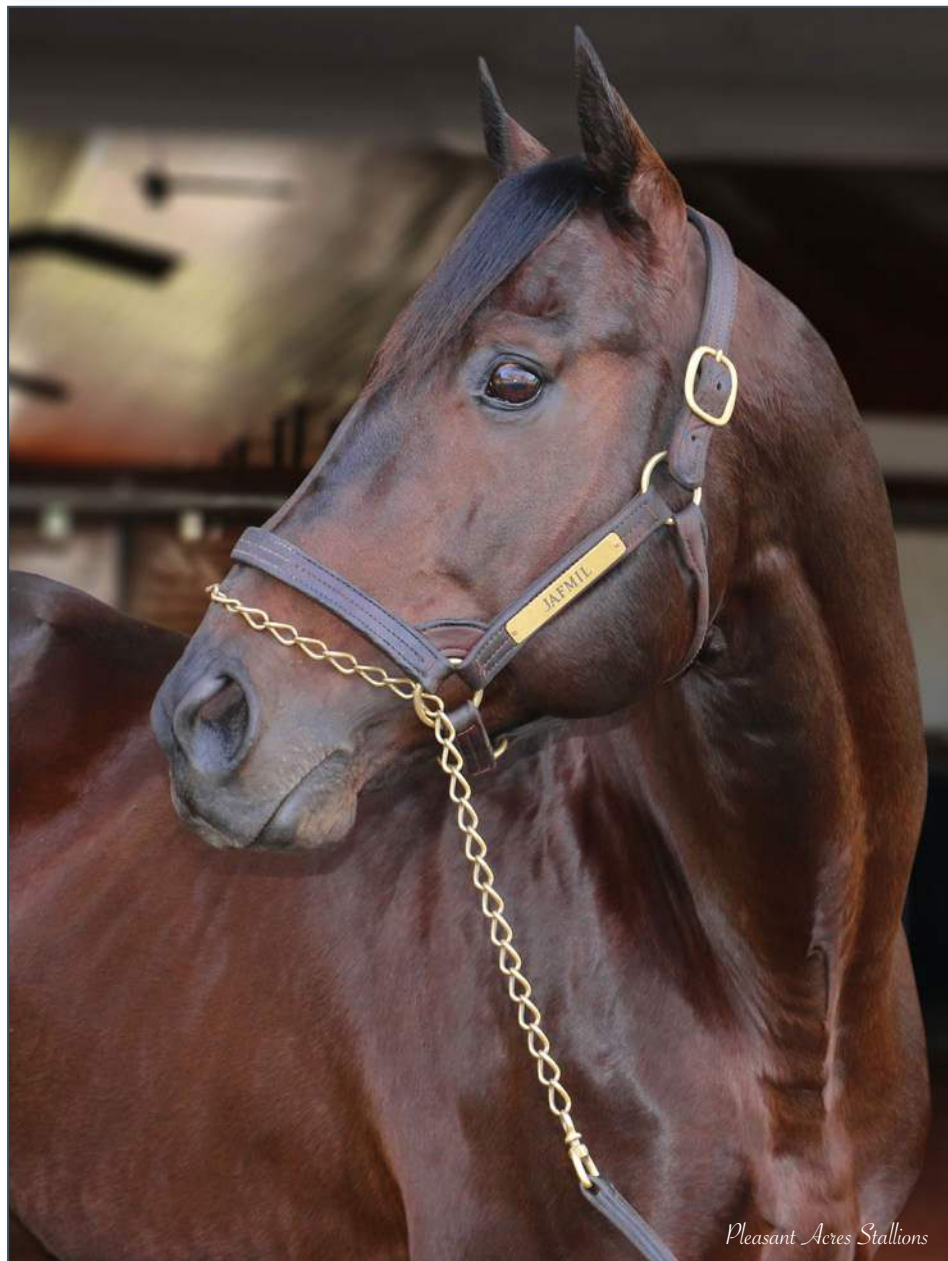
Pleasant Acres Stallions