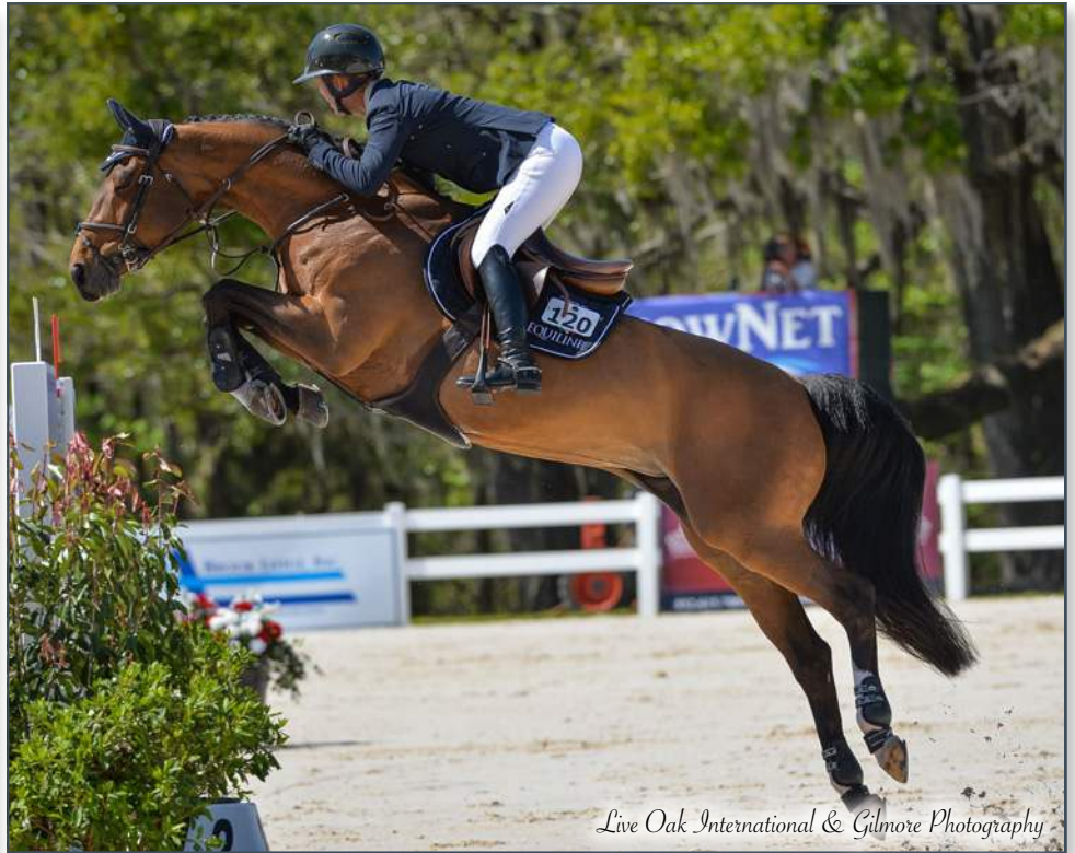
Live Oak International & Gilmore Photography