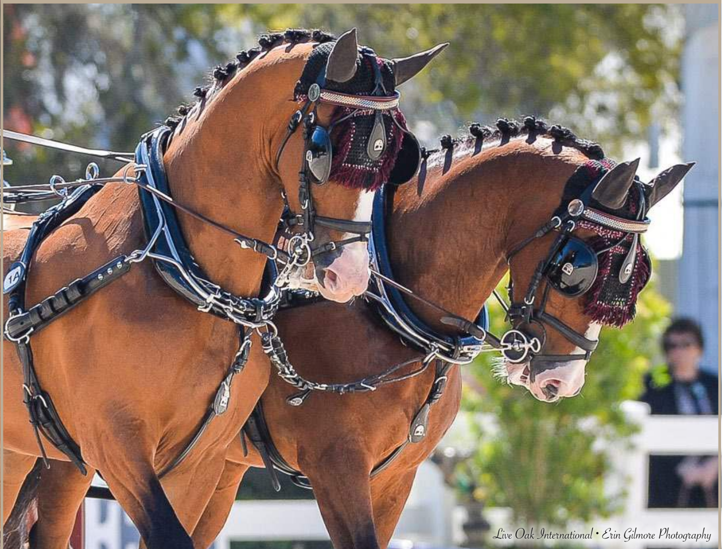
Live Oak International